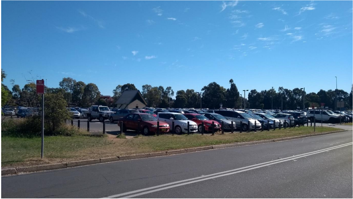
Figure 3 Looking at the subject site in a north-westerly direction from the corner of Moore St and Collimore Ave