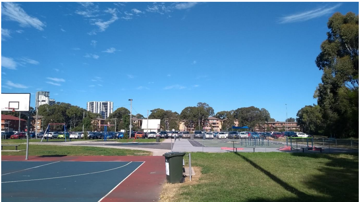
Figure 4 Looking down the site in a northerly direction from the basketball courts