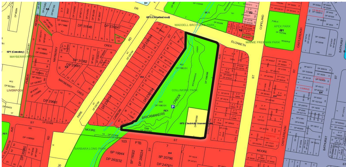
Figure 2: Zoning Map from LLEP 2008 (Subject site outlined in black)

Adjoining the site to the north is Elizabeth Drive and Waddell Brothers Park, with some low density residential dwelling located to the north-east. To the east of Collimore Avenue are a variety of low and medium density residential developments ranging from single storey dwellings to three storey residential flat buildings. A larger residential area is located to the south of Moore Street consisting of a variety of 3-4 storey residential flat buildings. Finally, Brickmakers Creek runs along the western edge of the site, with further low and medium density residential developments located to the west ranging between one and two storeys in height.