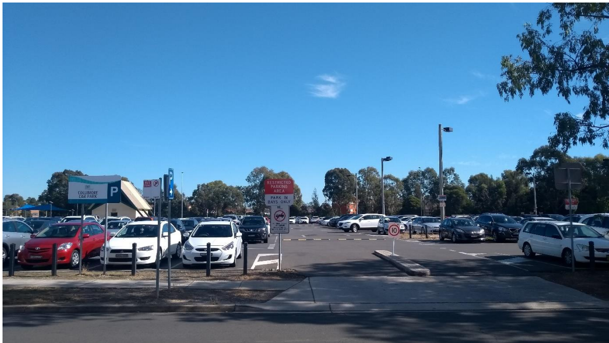
Figure 5 Looking at the subject site from Collimore Ave in a westerly direction