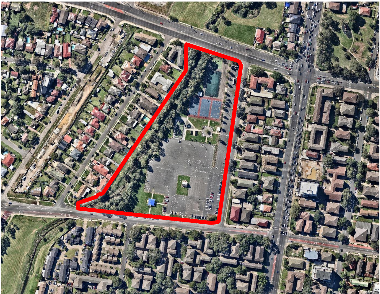
Figure 1: Location of subject site outlined in red (Nearmap 2019)

The subject site is located on the western edge of the Liverpool CBD area. The total area of the subject site is approximately 38,500m 2 . The site consists of the following lots, and are owned as follows: